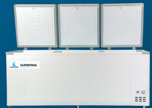
CCHTF 750 TD