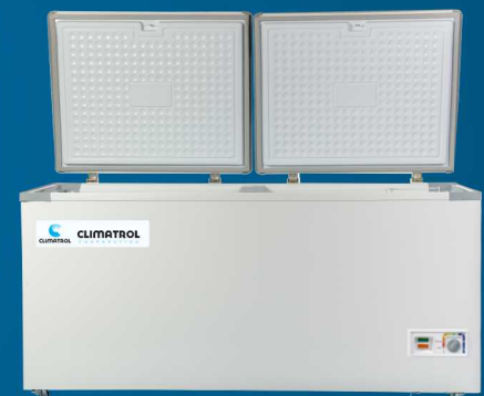
CCHTF 450 DD