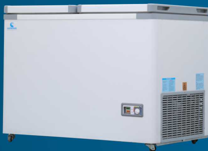
CCHTF 350 DD