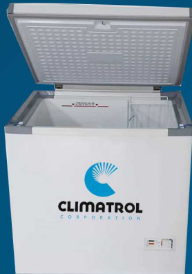
CCHTF 125 SD