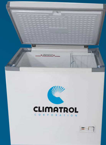
CCHTF 250 SD