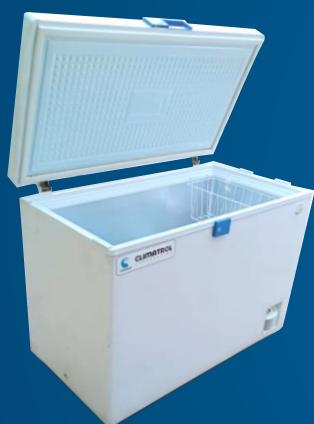
CCHTF 300 SD