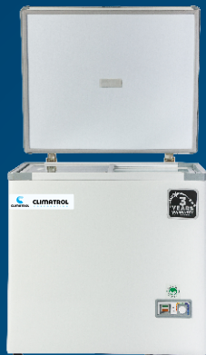
CCHTF 100 SD