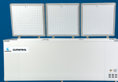
CCHTF 700 TD