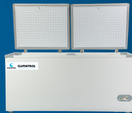
CCHTF 400 DD