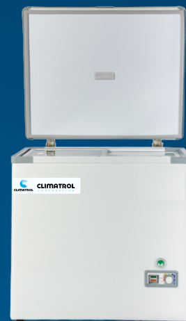
CCHTF 200 SD